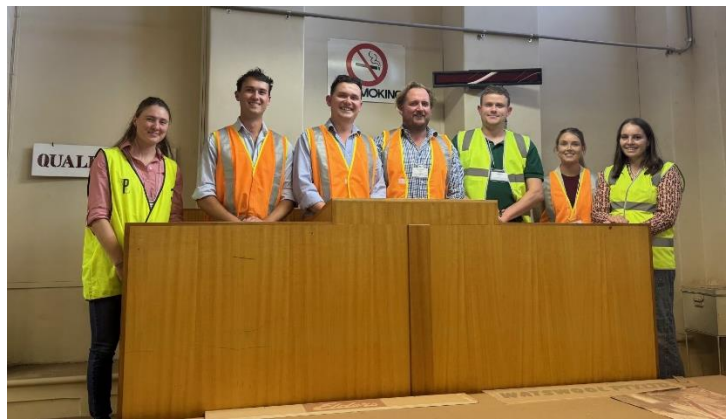
Adelaide Old Sale Rooms at Quality Wool